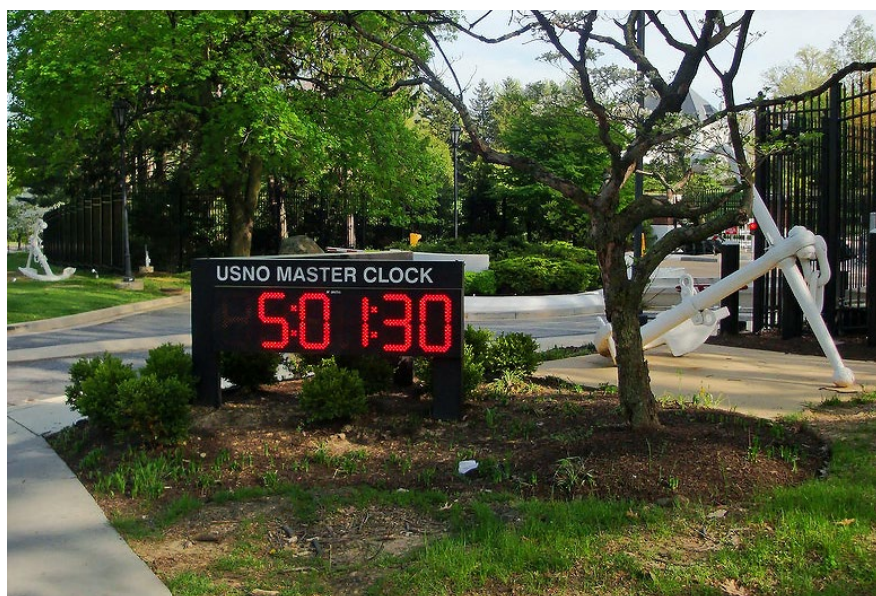
U.S. Naval Observatory Master Clock

Every network operator must understand time and how it affects their network(s). Accurate, synchronized time is critical to many network functions and to network security, yet many users of time services know little about the source of their time. In the United States, the principal sources of official time are the Coordinated Universal Time U.S. Naval Observatory, or UTC (USNO), and the Coordinated Universal Time National Institute of Standards and Technology, or UTC (NIST). See CISA's additional guidance for C-Suite executives and technical practitioners. 1,2