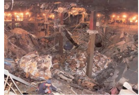
Figure 1: World Trade Center parking garage following the 1993 bombing that killed six people and injured 1,000

Goal 7: Safely coordinate response activities at IED incident sites. These C-IED tasks include activities by which outdoor events personnel can effectively and safely react at the IED incident site.