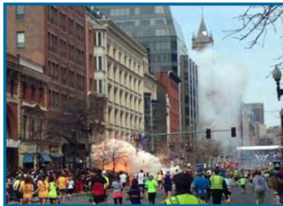
Figure 6: Photo taken immediately following the Boston Marathon bombing on April 15, 2013, that killed 3 people and injured several hundred. Property of DHS