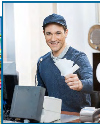
Figure 2: Outdoor event stakeholders